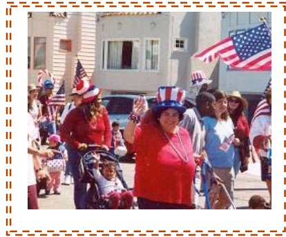
4 th of July Parade

District 11 Monthly Meeting – 2nd Saturday each month from 10:00 am-noon at the Ingleside Police Station Community Room, 1 Sgt. John V. Young Lane.