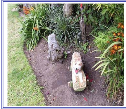
Neighbors & Friends Enjoying Our Parks