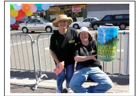
The Excelsior Street Fair