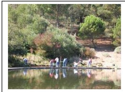
Hidden Parks, Many Surprises~ It's an extraordinary view from the Gleneagles Golf Course Clubhouse.