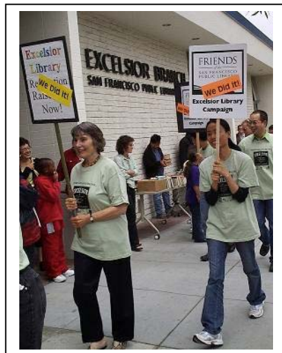
Excelsior Library Reopens