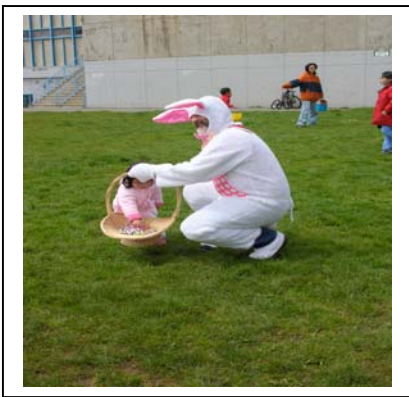
New Mission Terrace Easter Egg Hunt