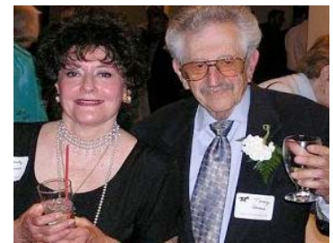
District 11 Democratic Club